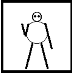
Stay on ground; follow instruction of my right hand.