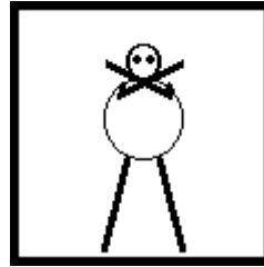
Cancel all previous instructions. Wait.

9.15.4 This permission does not relieve the competitor of complete responsibility for his take-off, including adequate lift to clear obstacles and other balloons, and to continue safely in flight. A competitor taking off without permission, whether due to loss of control or any other reason, may be penalized up to 500 competition points