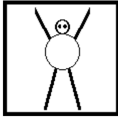
Clear for take-off